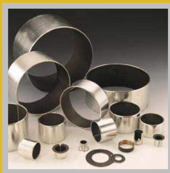
GEROLLTES VERBUNDGLEITLAGER, STAHL/PTFE, WARTUNGSFREI